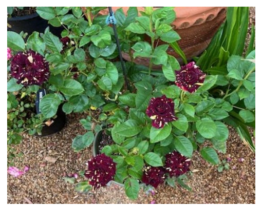
Left to right: 'Celestial Night', 'Memphis Music', 'Doc' (Seven Dwarfs series)