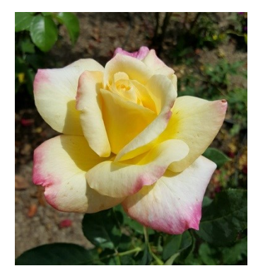
'Sue Streeper' Hybrid tea; yellow, with pink edges; average diameter 5"; large full blooms; plant height 4' to 5'; bred by Dick Streeper in 2013