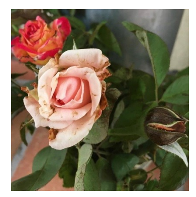
Chilli thrips' damage