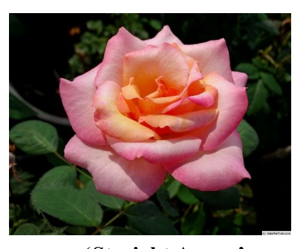
'Straight Arrow' Pink blend hybrid tea; average diameter bloom 4.5"; plant height 5' to 7'; rust and mildew free; brilliant blooms borne on very long straight stems; bred by Dick Streeper in 2003