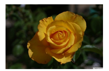
'Col Phil Ash' Deep yellow hybrid tea; discovered by Gary Bulman in 2013 (actually it was Sonja Bulman!) as a sport of 'Sunstruck'