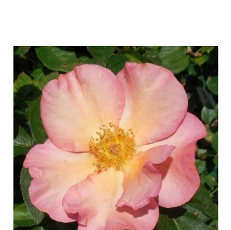
'Bronze Medal' Apricot or apricot blend miniflora; moderate fragrance; single to semi-double with average diameter bloom of 3"; plants grows up to 3'; bred by Bob Martin, 2014

This should prove to be a fun and competitive event! Come and join in and take home a special rose!