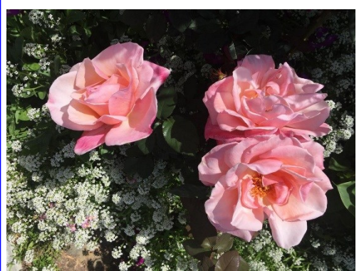
'First Prize' hybrid tea grown with alyssum