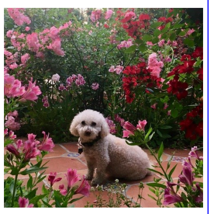
'Wing Ding' polyantha grown with Alstroemeria which requires very little water once established (shown with my dog Bowser)