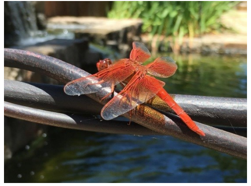
Our Friends in the Garden Clockwise from upper left: Syrphid fly, Dragonfly, Lacewing, Lady Beetle, Assassin Bug